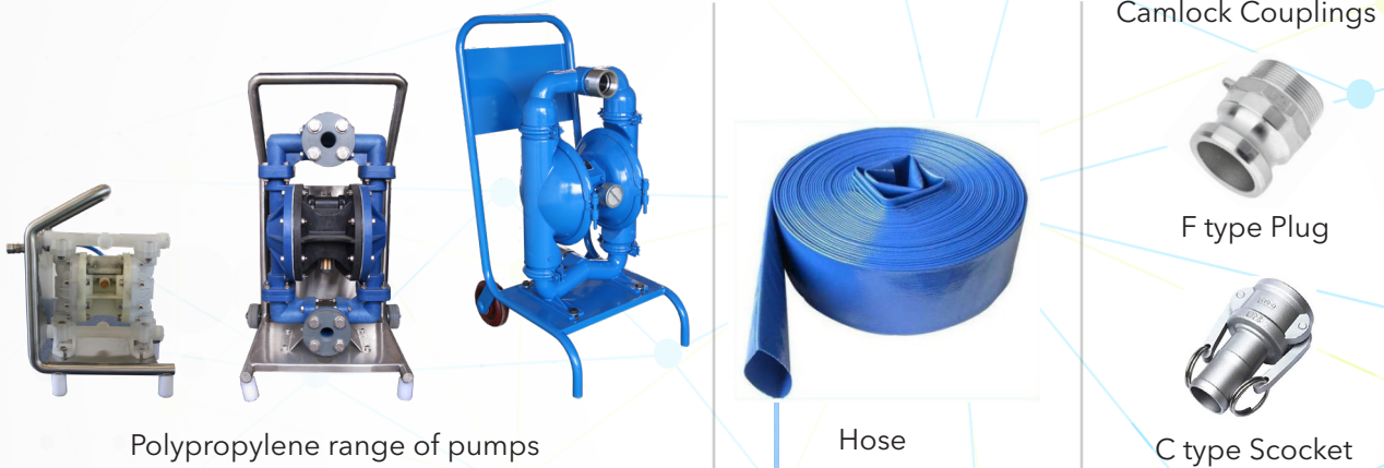
Polypropylene range of pumps

Our skid mounted Polypropylene range of pumps are well suited for the chemical feed into the cleaning guns, whereas our skid mounted SS pumps do excellent duty in slop removal especially with solid laden fluid. Some of the world's best known providers of cargo hold cleaning systems rely on Teryair pumps as part of their kit.